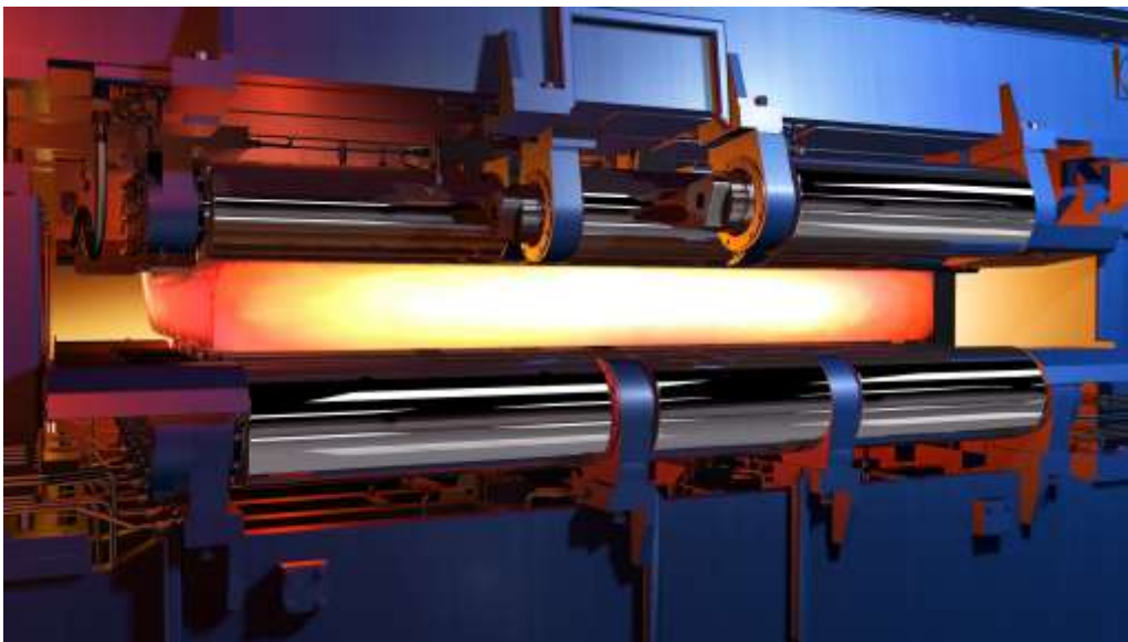
The STEC-Roll ® optimizes the casting process and is setting new standards in cost-effective maintenance.

SMS group is a group of companies internationally active in plant construction and mechanical engineering for the steel and nonferrous metals industry. It has some 13,500 employees who generate worldwide sales of more than EUR 3 billion. The sole owner of the holding company SMS GmbH is the Familie Weiss Foundation.