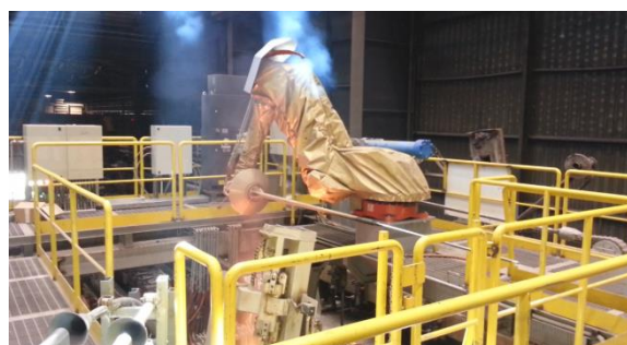
TS-Pro SAMPLER installed on a VD cover