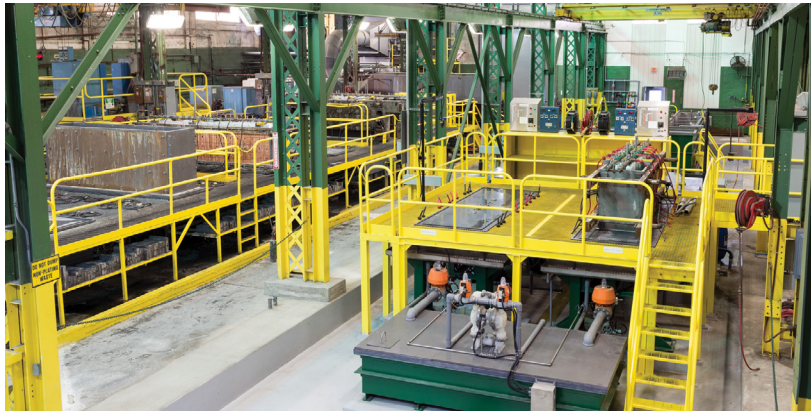
▲ A wide variety of in-house plating operations facilitate copper refurbishment with options ranging from copper to our premium nickel-alloy NanoGuard® Coating

A hardened nickel-based super alloy, it can be applied as a step or full-face coating and retains its physical properties very well at casting temperatures. Our NanoGuard® Mold