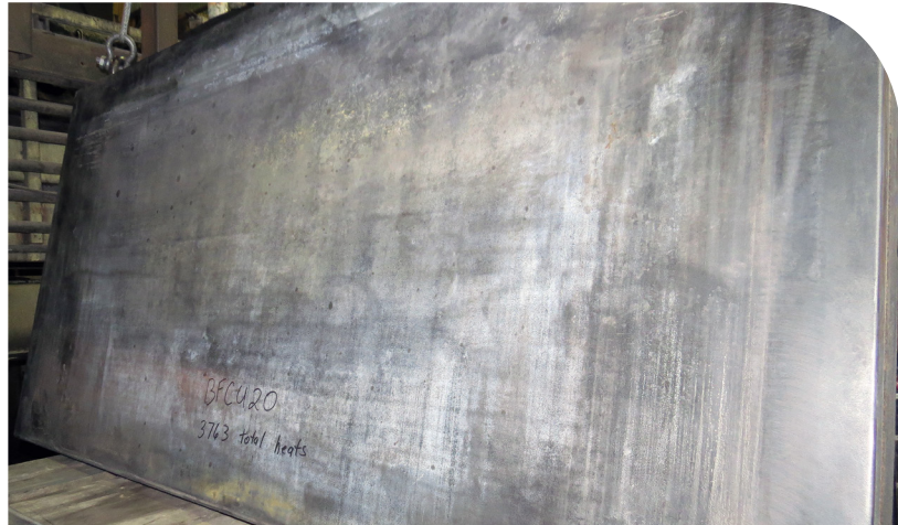
▲ After being in service for more than 500,000 tons, this broad-face copper coated with our UniGuard® Coating was returned to service